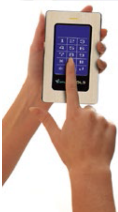
Patented touch-screen technology

Say goodbye to complicated software or drivers – all DL3 encryption, administration, and authentication are performed on the unit itself and managed through easy-to-use touch screen technology.